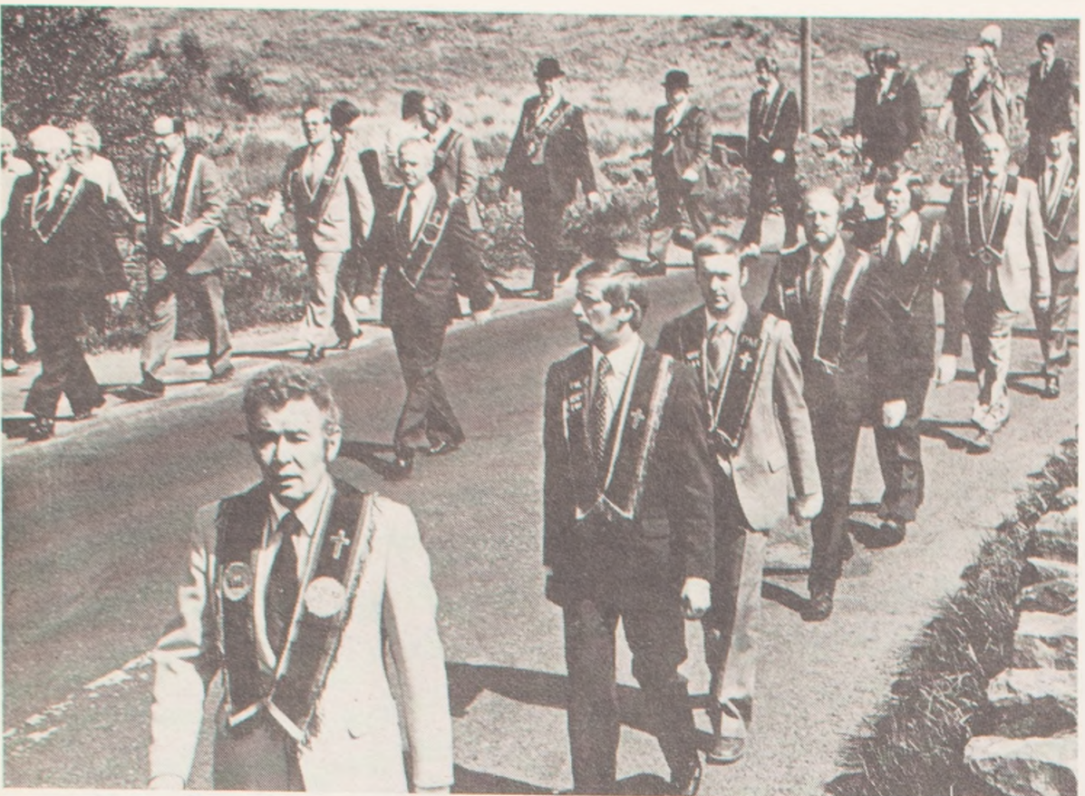
Members of Portadown Royal Black District Chapter preceptories parading to the annual service of RBP No.267 held at Vinecash Presbyterian Church, near the town.