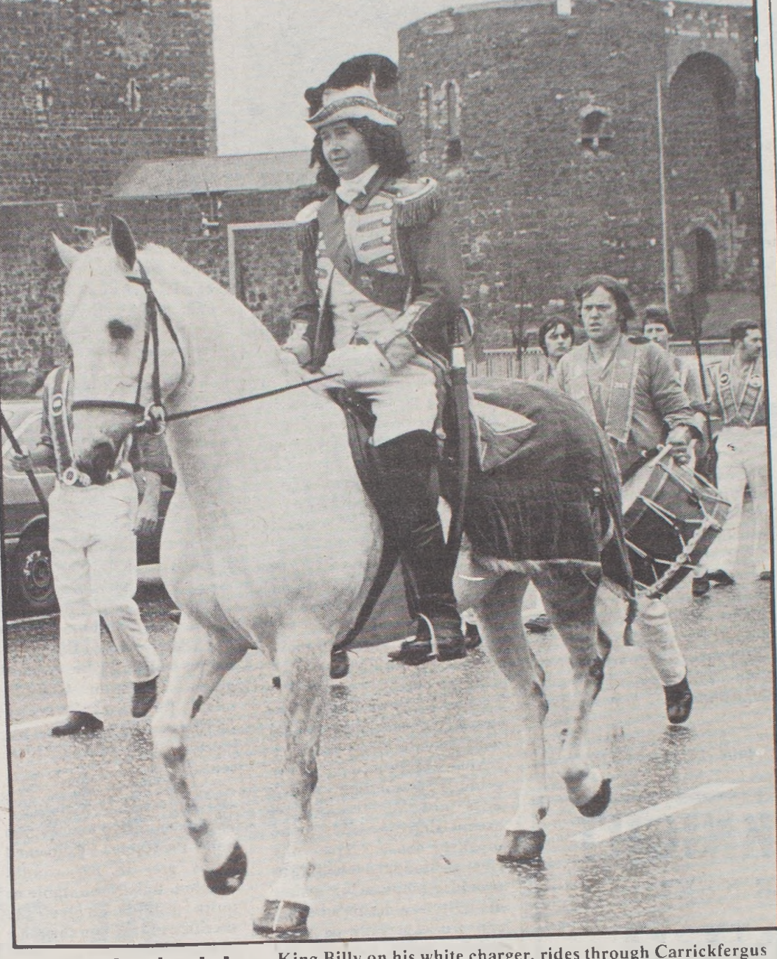
Historical visit marked

Why is it so many people in key positions appear to find it necessary to give such a pro-ecumenical slant to a large percentage of programmes? It surely cannot be because ecumenical viewers are better licence payers than anti-ecumenical viewers!