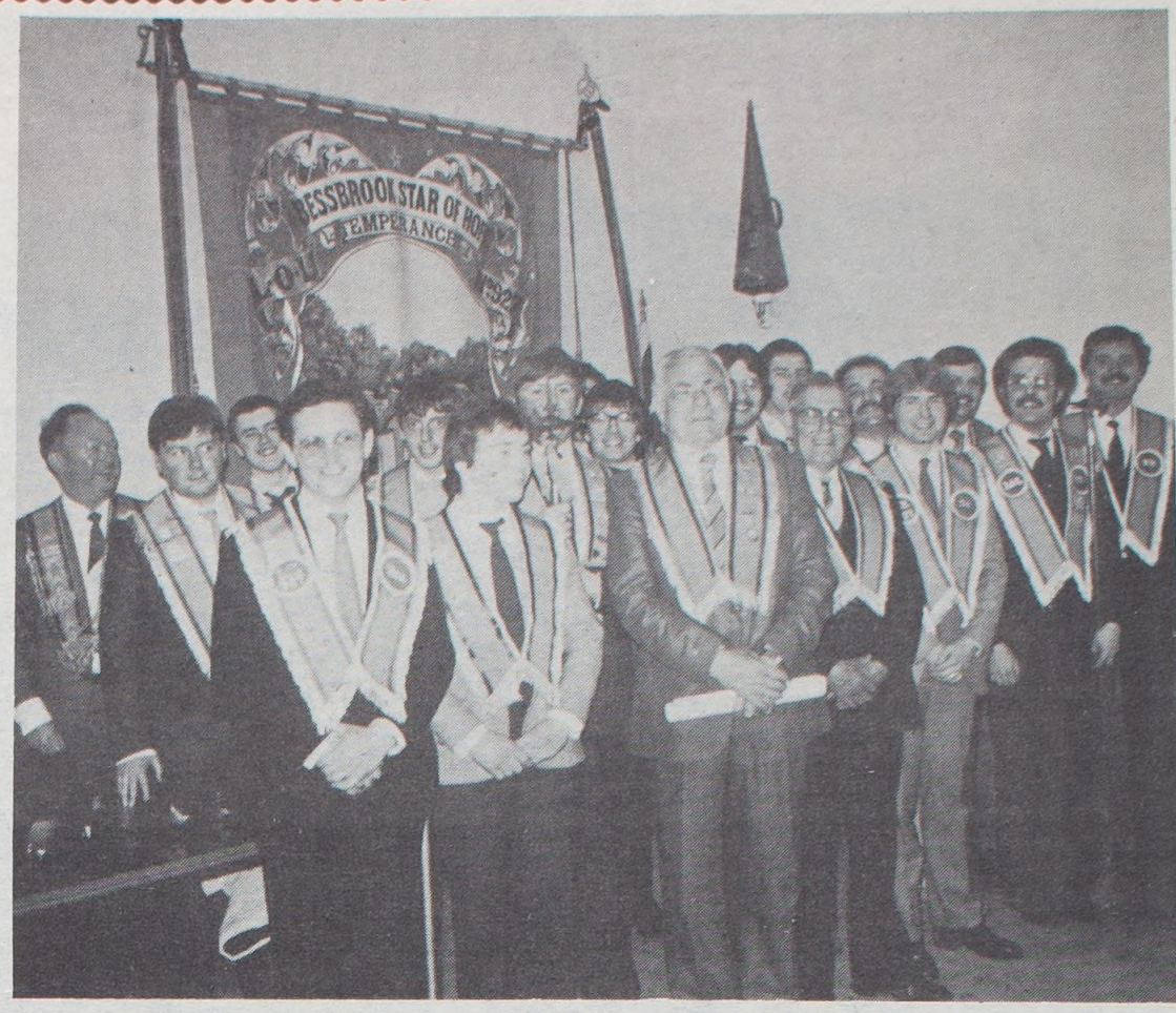
A Section of LOL 927 assembled before new Banner.