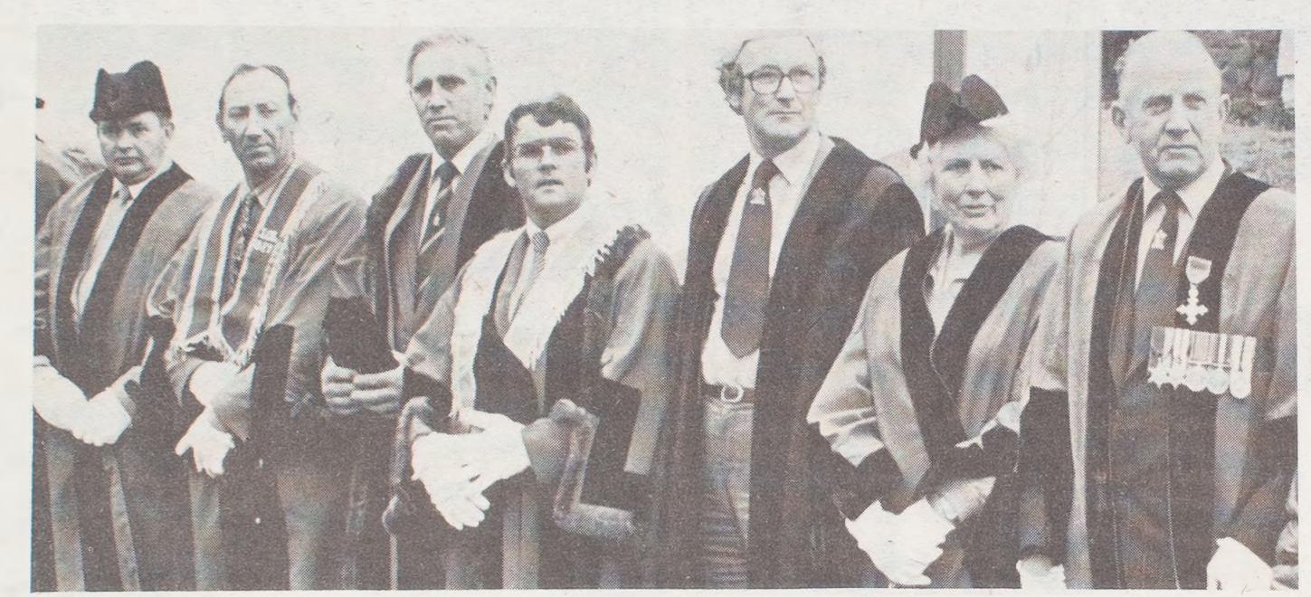
The Mayor of Carrickfergus and members of the Borough Council await the arrival of "King William"

Orangemen of Carrickfergus and district last month celebrated the landing of King William the Third in their town 292 years ago.