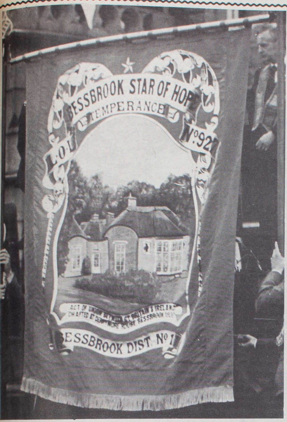
New Banner featuring Derrymore House, Bessbrook.