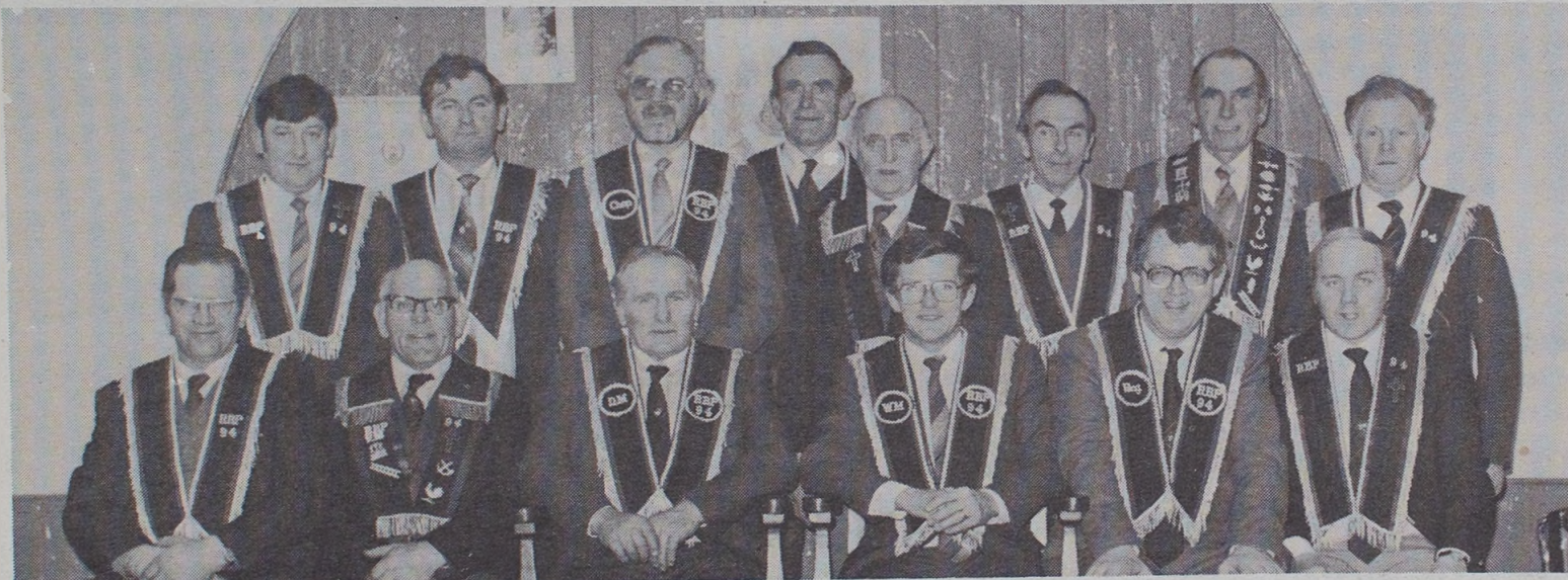
The W.M. and other officers of R.B.P. No. 94 following their installation in Killaloo Orange Hall.