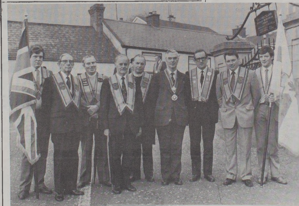
Platform party at the 60th anniversary of the Sir Henry Wilson Memorial Orange Hall, Loughbrickland

The official re-opening of the new hall was performed by Mr. Harold McCusker, M.P.