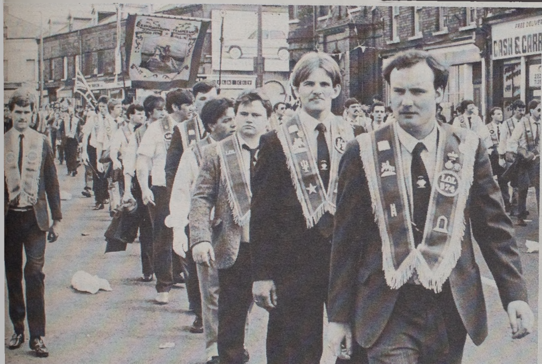
Orangemen on parade to the West Belfast parade to Whiterock on Saturday June 29.