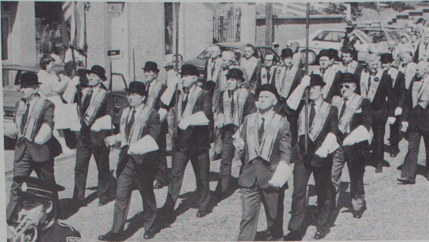
Orangemen and women on parade to the service in Bessbrook Presbyterian Church on Sunday June 2.

More than 400 Orangemen and women attended the annual parade and service in Bessbrook Presbyterian Church on Sunday June 2, organised by Bessbrook District LOL No. 11.