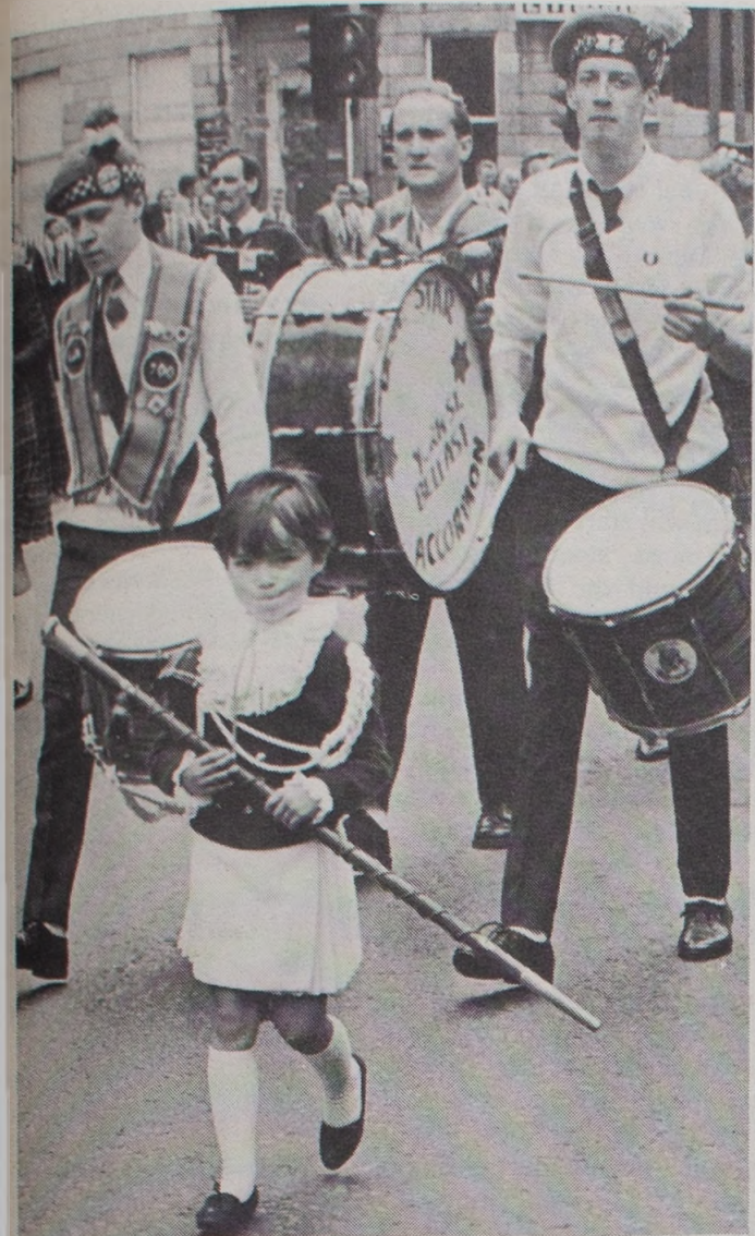
York Street, Belfast accordion band steps out in the parade to Whiterock Orange Hall on Saturday June 29.