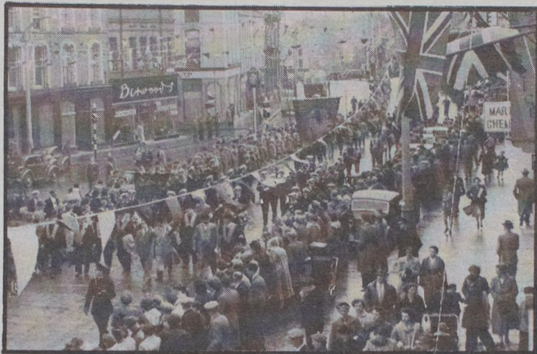
A 1952 picture of the '12th' July parade in Portadown

The Orders did not seek this confrontation, which was brought about in a ham-fisted and insensitive manner adopted by the authorities last year. It