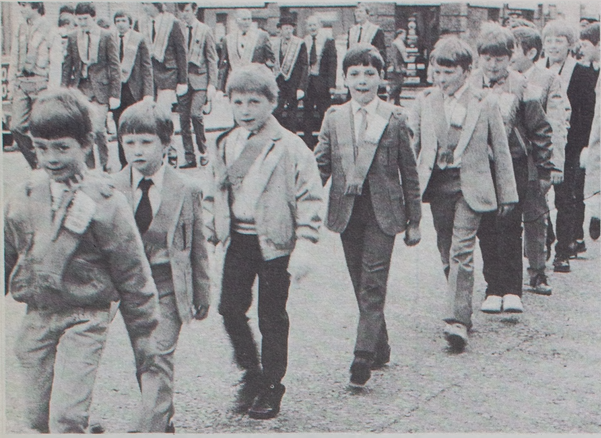
Some of the 400 young Junior Orangemen from various parts of Northern Ireland who attended a service held under the auspices of Portadown Junior District, in St. Mark's Church, Portadown.