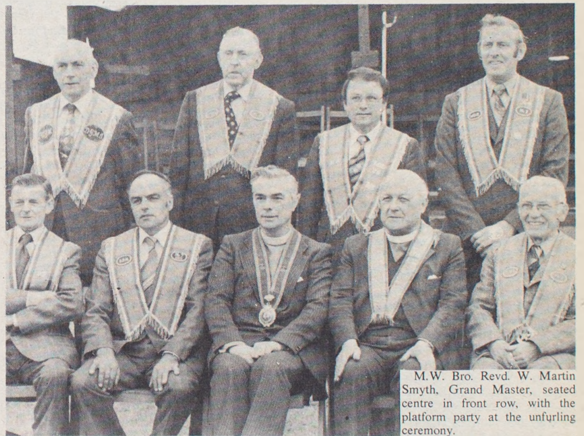
M.W. Bro. Revd. W. Martin Smyth, Grand Master, seated centre in front row, with the platform party at the unfurling ceremony.

He urged those in the Orange Order to live out the principles of their institution in every day life. "This banner reminds us," he said, "that we must take our place in the leadership of the community."