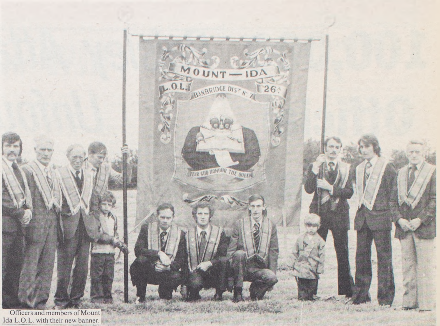
Officers and members of Mount Ida L.O.L. with their new banner.

The principles for which Orangeism stands are as right today as they were in the 18th century, declared the Grand Master, Most Wor. Bro. W. Martin Smyth, B.A., when he spoke at the unfurling of a new banner for Mount Ida L.O.L. No. 26A, Banbridge District.